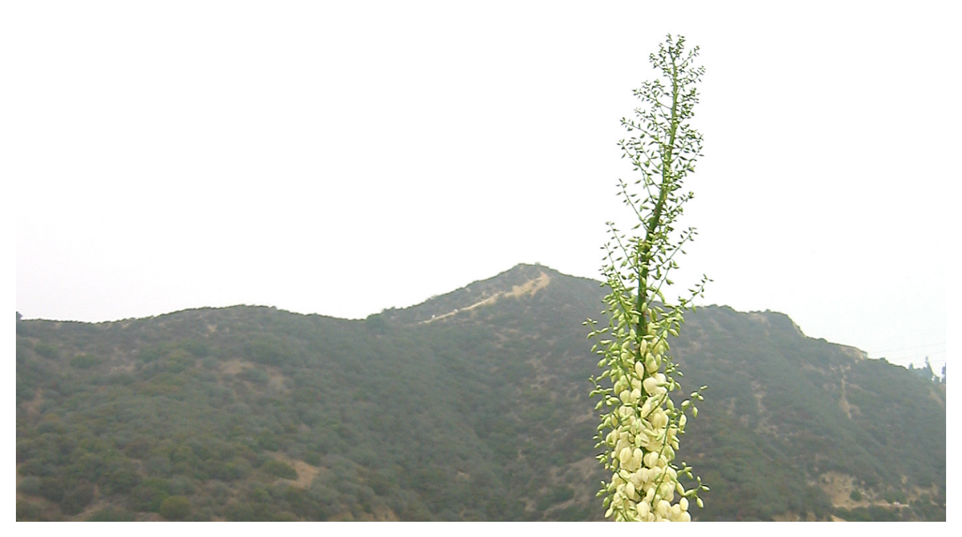
CHAPTER | ONE