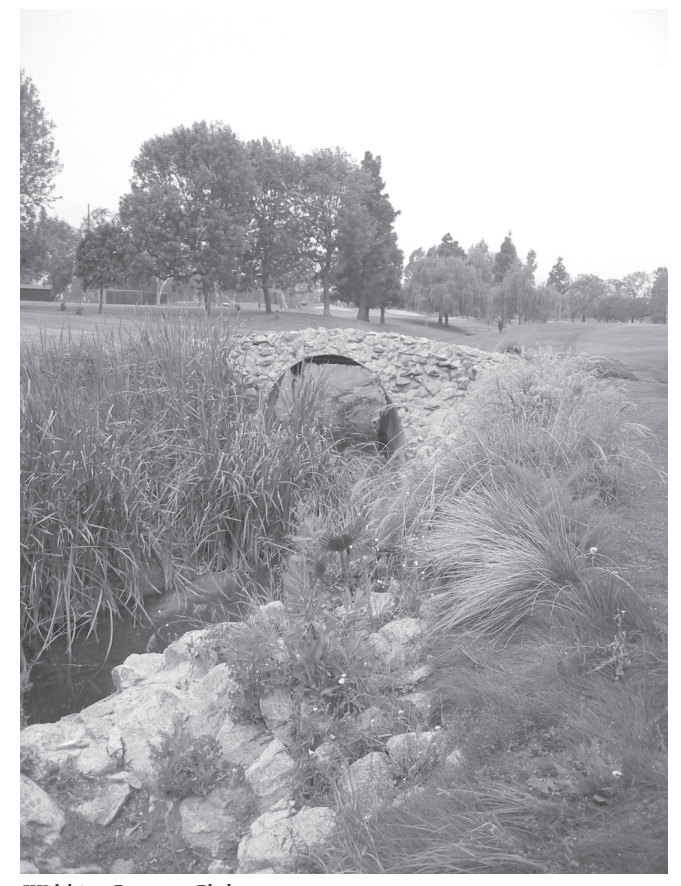
Wilshire Country Club

To support cattle on the working ranchos, land was cleared and nonnative grasses introduced. Dense vegetation surrounding the creeks was cleared to make way for farmland and, later, villages. The availability of surface and groundwater and the favorable climate created ideal conditions for a variety of crops. As the population of the Los Angeles area grew, demand for farmland became more intense, and the flatlands were transformed from cattle ranches to highly productive farmlands.